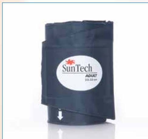
All-Purpose Durable™ BP Cuff

Engineered For Reliability & Patient Comfort