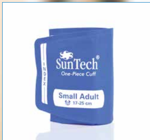
One-Piece Durable™ BP Cuff