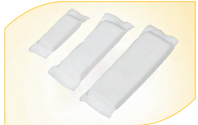
Ameritus Limb-Board – FM Series