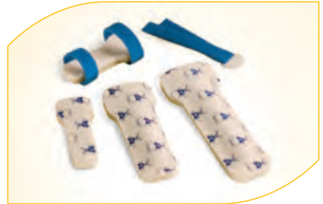
Ameritus AccuBoard - Formable AB Series Available with or without soft straps