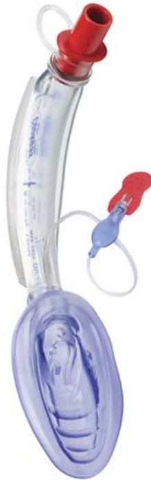
3.5 disposable air-Q Blocker