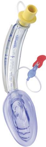
2.5 disposable air-Q Blocker