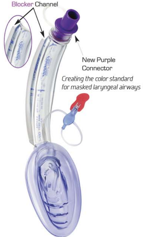
4.5 disposable air-Q Blocker