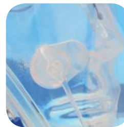
Dedicated air tight NG tube port