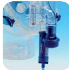
Configuration for CPAP with “Easy Vent” Venturi Generator