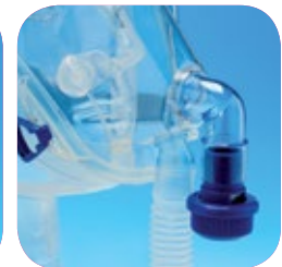
Configuration for single limb ventilator or CPAP Generator