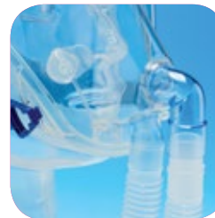
Configuration for dual limb ventilator